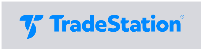
Background values should be 40% or less when using a TS Blue Logo.