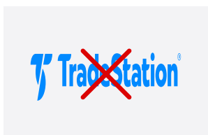
Do not distort.

Our logo has been designed to offer flexibility in a variety of designs and media, consistently linking touchpoint to touchpoint. Always use the approved digital artwork. Never alter the logo in any way.