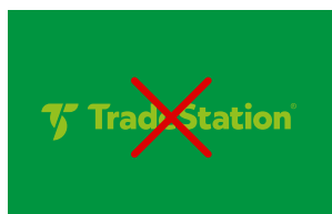
Do not change the color or use a gradient fill.