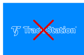
Do not outline or change the font.