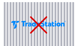
Do not place over busy backgrounds or patterns.